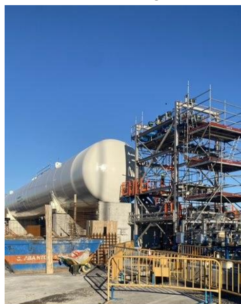
Construction – Bilbao

Both Spanish terminals are to be co-financed by the European Commission through the CEF- Connecting Europe Facilities Programme.